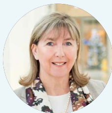
Lydie Polfer Mayor

On behalf of the City of Luxembourg's College of the Mayor and Aldermen, we hope that this brochure will answer all your questions about these new grants and inspire you to join us in our efforts to protect the environment.